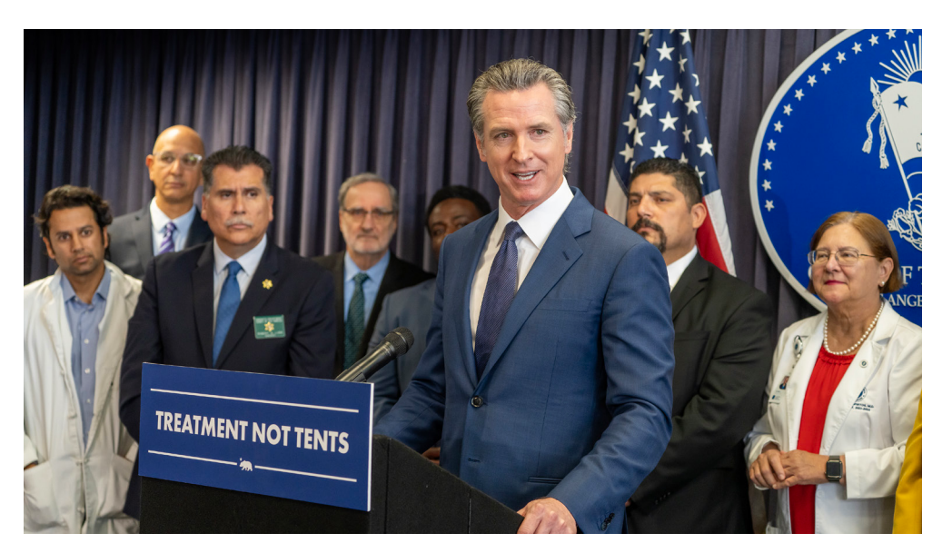
Learn more about the reform here.

BIGGER PICTURE: Transforming the Mental Health Services Act into the Behavioral Health Services Act and building more community mental health treatment sites and supportive housing is the last main pillar of Governor Newsom's Mental Health Movement-pulling together significant recent reforms like the 988 crisis line, CalHOPE, CARE Court, conservatorship reform, CalAIM behavioral health expansion (including mobile crisis care and telehealth), Medi-Cal expansion to all low-income Californians, Children and Youth Behavioral Health Initiative (including expanding services in schools and on-line), Older Adult Behavioral Health Initiative, Veterans Mental Health Initiative, Behavioral Health Community Infrastructure Program, Behavioral Health Bridge Housing, Health Care Workforce for All and more. (More details on next steps here.)