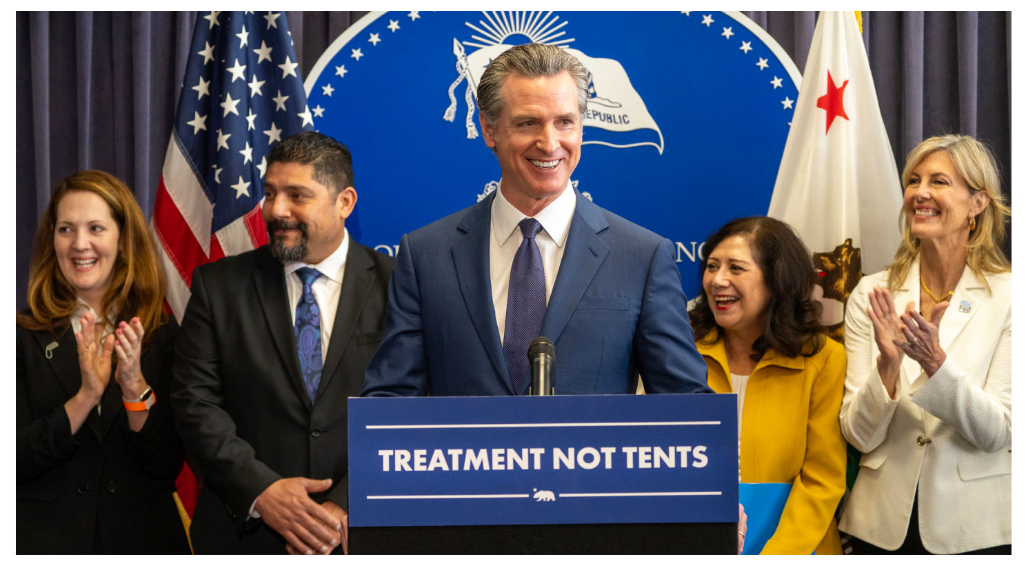
The newly passed initiative builds on the Newsom Administration's prior investments (here & here) and reforms (here & here), and will enable California to fully transform its behavioral health system for the first time in 20 years.